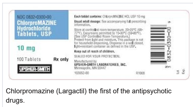
Chlorpromazine (Largactil) the first of the antipsychotic drugs.

Although the early anti-psychotics (called typical) did have sedating effects and in high doses could cause people on them to become slow and lethargic, anti-psychotics are not used principally for that effect but for the benefit that they bring in helping to alleviate the positive symptoms of schizophrenia such as the delusions and hallucinations. 8