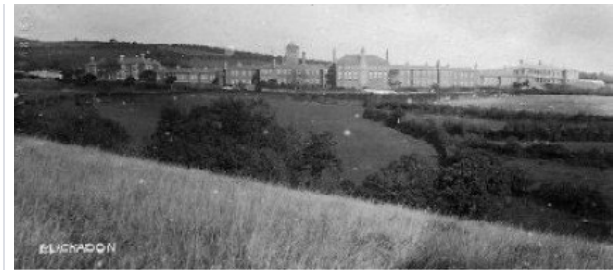
Before the advent of the antipsychotic drugs most people with a diagnosis of schizophrenia were confined in one of the large asylums, like this one on the edge of Dartmoor, sometimes for many years.

Whatever the reason we believe that this issue is an area that should become absolutely key in our study of this condition and development of our treatment models in future years. Many thousands of bright and intelligent people who could be making a creative contribution to the wellbeing and prosperity of our society are currently consigned to a life of low achievement because of these issues. After all other