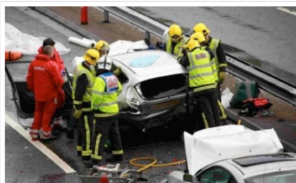
Suicide by people with schizophrenia accounts for as many deaths in the UK as traffic collisions.

Schizophrenia is predominantly an illness of young people: 70% of all cases being diagnosed between the ages of 16 and 25. It also happens that most violent crime is carried out by young people. So although the proportion of homicides committed by people with schizophrenia is greater than the incidence of schizophrenia in the population as a whole, the statistics are skewed by the age of the attacker and it is by no means clear that people with schizophrenia are more likely to commit violent crimes than people who do not have the condition.