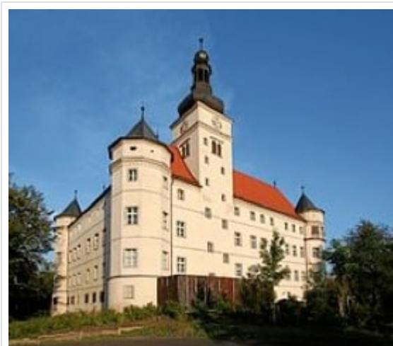
Hartheim Euthanasia Centre in Germany where over 18,000 people with disabilities including people with schizophrenia were killed during the Third Reich.

And lastly, genes with adverse affects on the species tend to be bred out of the gene pool during the natural process of evolution and the fact that the schizophrenia gene has survived this long implies that it must impart beneficial traits to the species in addition to the adverse one. Eliminating the schizophrenia gene would therefore almost certainly cause as much harm to the gene pool as benefit. There is already some prima facie evidence for this. People with schizophrenia are thought to have a reduced incidence of certain physical illnesses such as rheumatoid arthritis and some cancers.