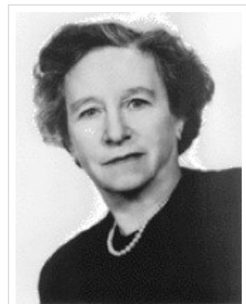
Freida Fromm-Reichman the German psychoanalyst who saw the family upbringing as being the cause of schizophrenia.

In the past such family theories have been widespread amongst professionals who have seen the person's family as being part of the problem rather than as an important factor in the overall therapeutic solution. Families were often denied information about their loved one's condition and people suffering from psychotic episodes were sometimes removed from their supportive family home to live in seedy bedsits where they were often unable to cope with the pressures of everyday life and were targeted by predatory or anti social neighbours. The families were then stigmatised as being the cause of their loved ones problems. The theories which gave rise to these abuses were often not tested by evidence and thankfully we have left them behind. However it is still possible to occasionally encounter older professionals who stubbornly cling to these beliefs.