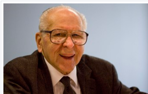
Dr Thomas Szasz, American psychoanalyst who believed that schizophrenia was a myth.

In the middle of the 20th century there were those in the anti-psychiatry movement