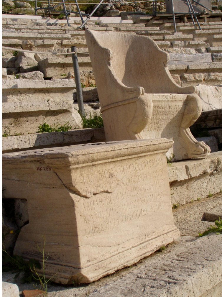
Ehrensitz im Dionysostheater