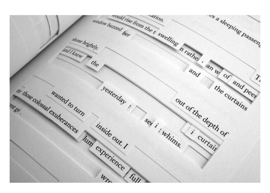
Figure 1 Image from Tree of Codes by Jonathan Safran Foer. Reproduced with permission from Visual Edition

That said, in the last six years, what has become evident is that the new entertainment norm, not the exception, is "transmedia" storytelling: "a process where integral elements of a fiction get dispersed systematically across multiple delivery channels for the purpose of creating a unified and coordinated entertainment experience. Ideally, each medium makes its own unique contribution to the unfolding of the story" (Jenkins 2011; emphasis in original). As such it is more likely to target different audiences through different media: "not everyone wants to watch the movie and play the game" (Dena 2009: 162)—but we may want to enter the narrative and its world through some other medium (a graphic novel, for example) or to access backstory or other characters' perspectives. (For more on adaptation in relation to transmedia, see Dena 2009: 147-63.) In marketing terms, "franchise" storytelling was certainly already driving some adaptational practices as I completed this book (see "The Economic Lures" section of Chapter 3), but now, as the Epilogue explores in detail, franchising through transmedia design dominates the marketing strategies of the entertainment industry. And in so doing, it is forcing a rethinking of certain aspects