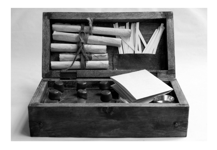
Figure 5 Campfire NYC photos of Westeros scent boxes. Reproduced under Creative Commons license

At issue throughout this long discussion thread are a series of perceived oppositions: adaptation vs. transmedia storytelling; franchise transmedia vs. transmedia storytelling (also parsed by Carrie Cutfort-Young as merchandising/objects vs. experience, which becomes problematic with game adaptations); original authorial/intentional transmedia productions vs. later add-on extensions; and in one response, franchising transmedia vs. participatory transmedia, where users/consumers are invited to participate in the story. Adaptation is