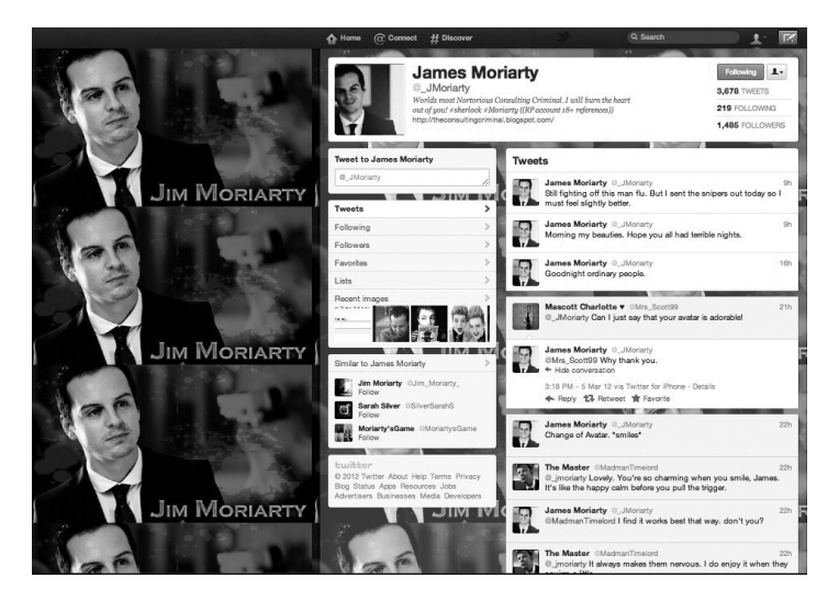
Figure 2 Exchange via @_JMoriarty Twitter page. Reproduced with permission from the account holder