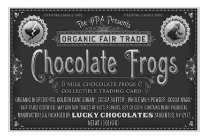
Figure 6 HPA Chocolate Frogs.